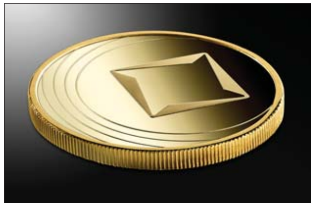
1 oz – reverse