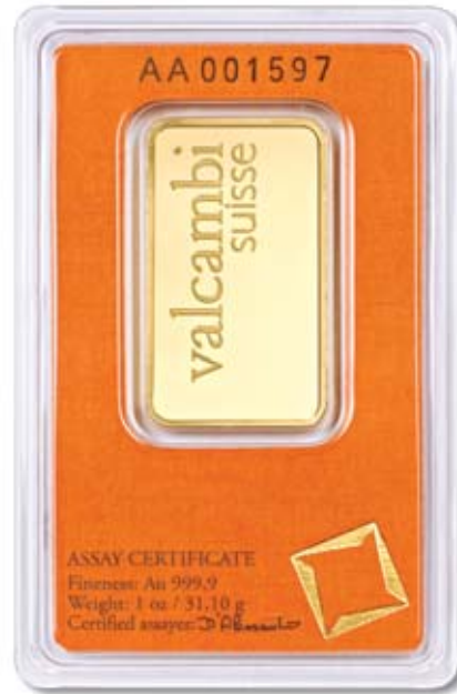
1 oz – reverse

Minted bars are packed in a sealed blister that contains a serial numbered certificate.