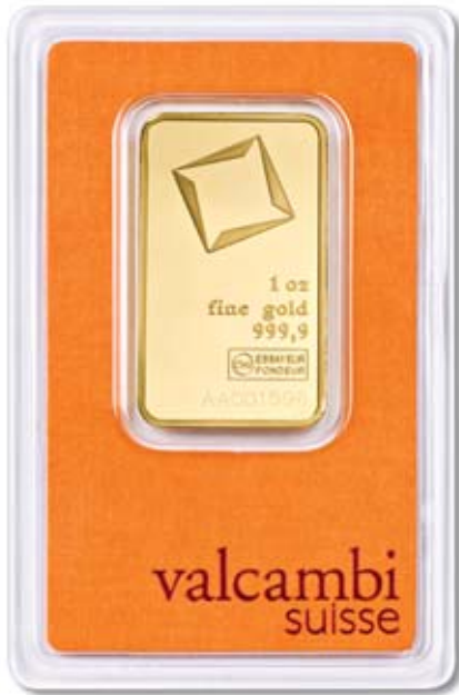
1 oz – obverse