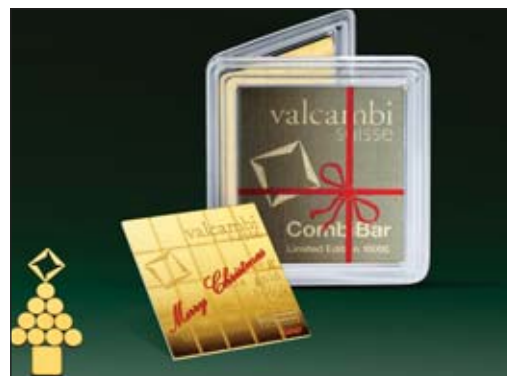
20 x 1 g CombiBar™ - Christmas Edition