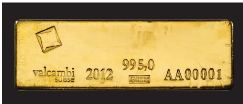
London Good Delivery 400 oz bar