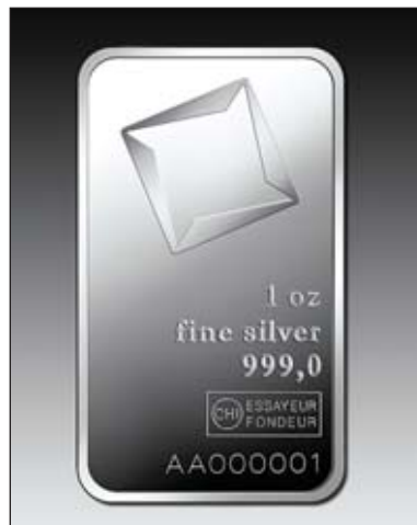
Silver – 1 oz

Valcambi has manufactured London Good Delivery platinum and palladium bars (since 1997) and silver bars (since 1972), as well as an extensive range of smaller bars.