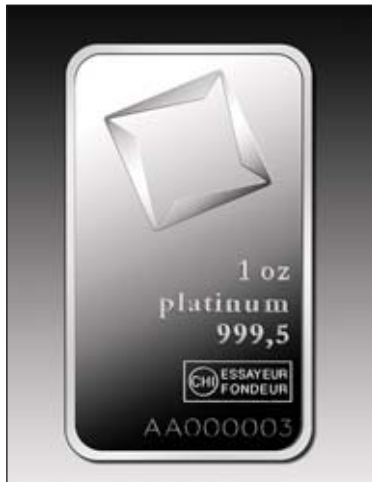
Platinum – 1 oz