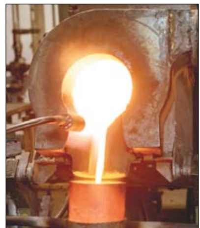
Pouring molten gold.