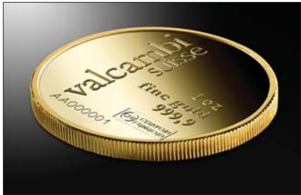
1 oz – obverse