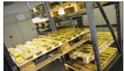
Valcambi offers gold vaulting and custody services to its clients. Minimum quantity: 100 kg.

The bars, which enable customers to trace the source of the gold content, have been available since 2008.