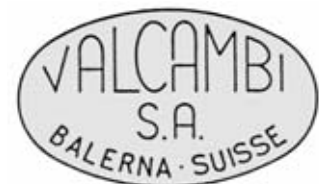
On bars issued under the name of Valcambi SA from 1967 until 2002.

An exception: the stamp was applied to 400 oz bars until 2006.