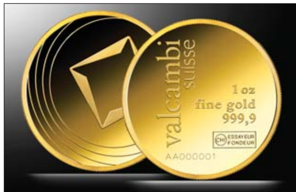
The new Valcambi logo was applied to minted round bars in 2013.