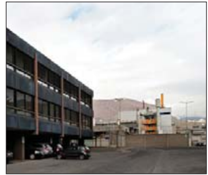
Valcambi's refinery is located in south eastern Switzerland.

The company has its own in-house design workshop and manufactures its own master tools and dies.