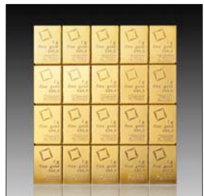
CombiBars™ have been issued since 2011.