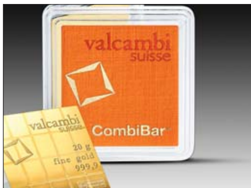
20 x 1 g CombiBar™