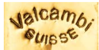
On bars issued under the name of Valcambi SA from 2003 until 2012.