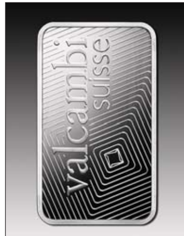
Palladium – 1 oz