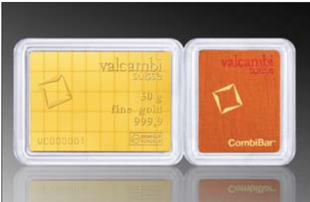
The innovative multifunctional CombiBar™, containing 50 x 1 g bars, was launched in 2011.